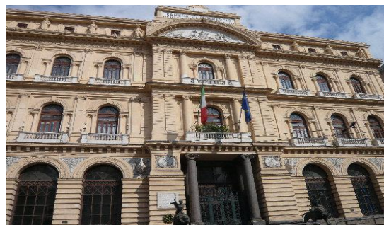
Headquarters of the Chamber of Commerce of Naples

Headquarters of the Chamber of Commerce of Naples Via S. Aspreno 2, Napoli