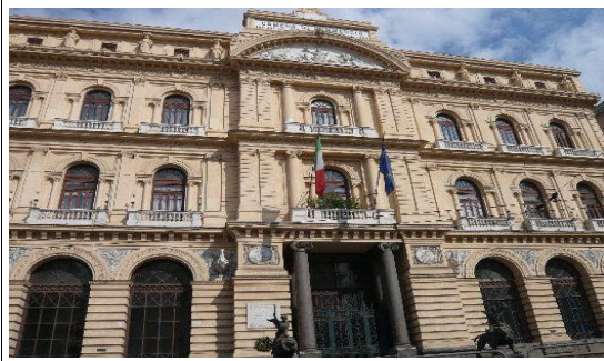
Headquarters of the Chamber of Commerce of Naples

Headquarters of the Chamber of Commerce of Naples Via S. Aspreno 2, Napoli